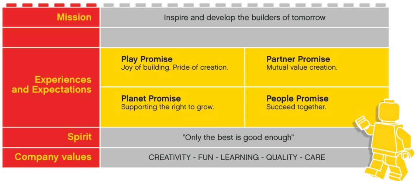
LEGO Brand Framework and the 4 promises

To ensure that people are clear about what they can expect from the brand, and the people within the LEGO Group are clear about what is required to fulfil these expectations, it is essential that the brand promises are widely understood and strongly believed.